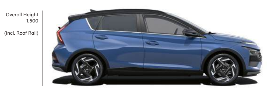
Overall Length Wheel Base