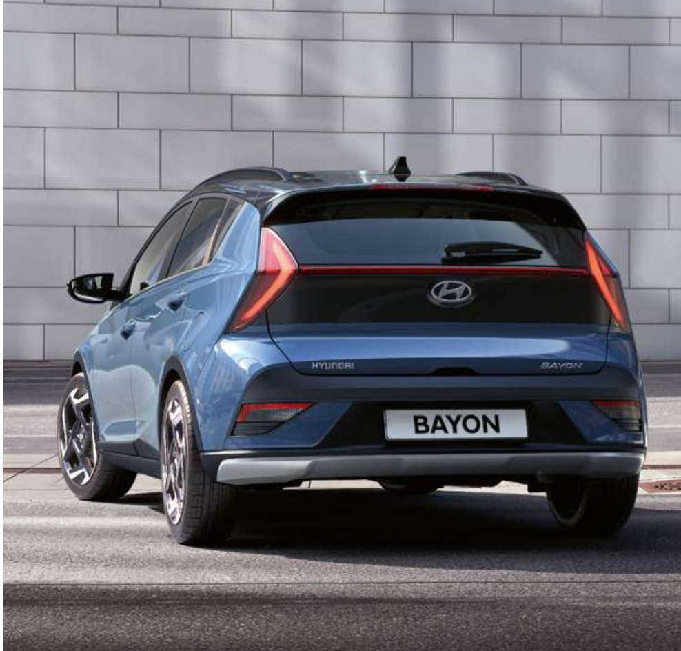
Distinctive from every angle, the signature arrow-shaped rear combination lamps really put an exclamation point on the expressive exterior.