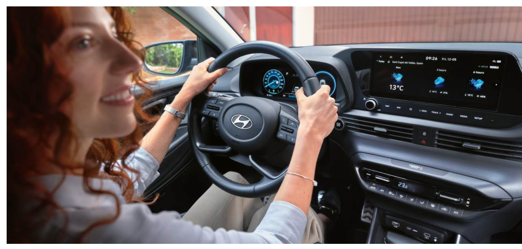
For fast and easy smartphone charging, there's a wireless charging tray in the centre console and USB-C ports in the front and rear.