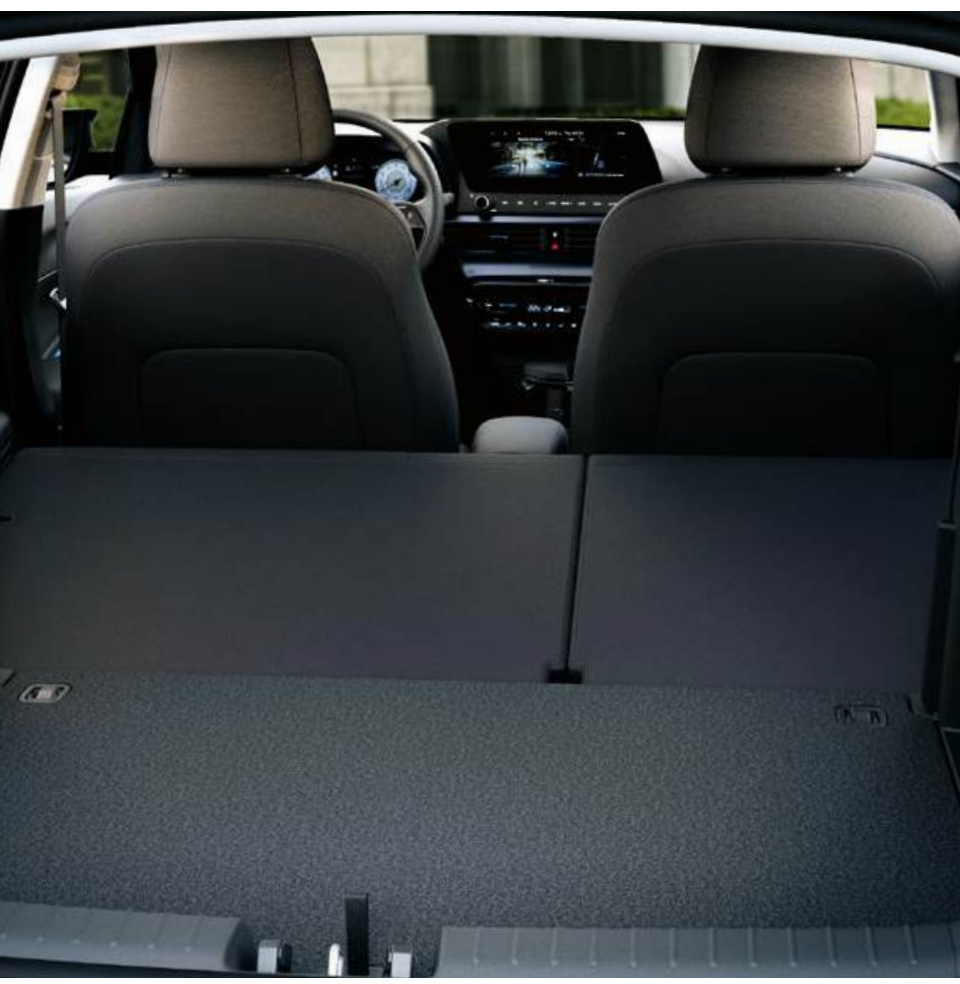
Delivering the comfort and storage space of an SUV, the BAYON features 60:40 foldable rear seats that give you the flexibility to load larger, bulky items as well.