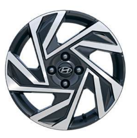
16" alloy wheel