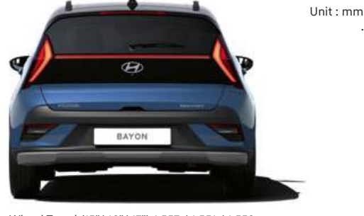
Wheel Tread (15"/ 16"/ 17") 1,557 / 1,551 / 1,552