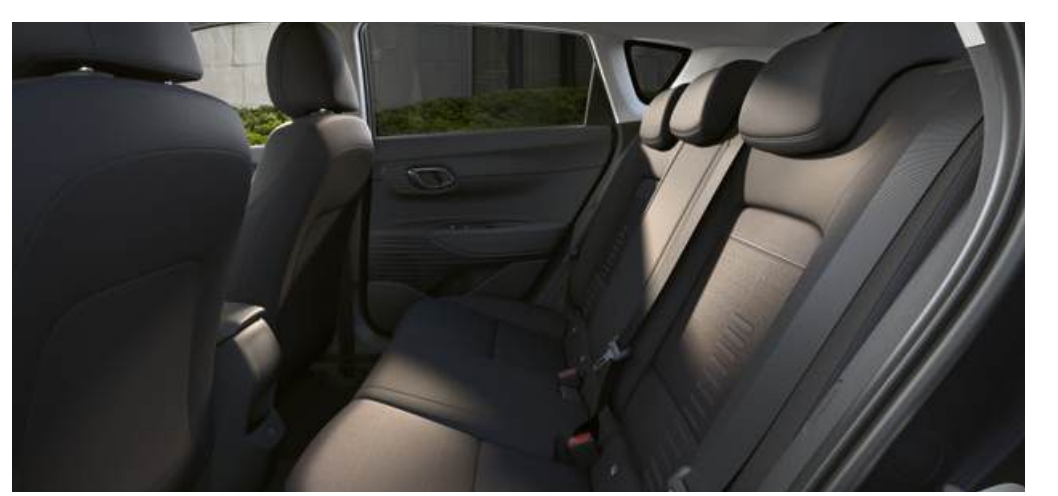
Featuring excellent legroom and 411 litres of boot space – BAYON stands out in the segment with its style and roominess.