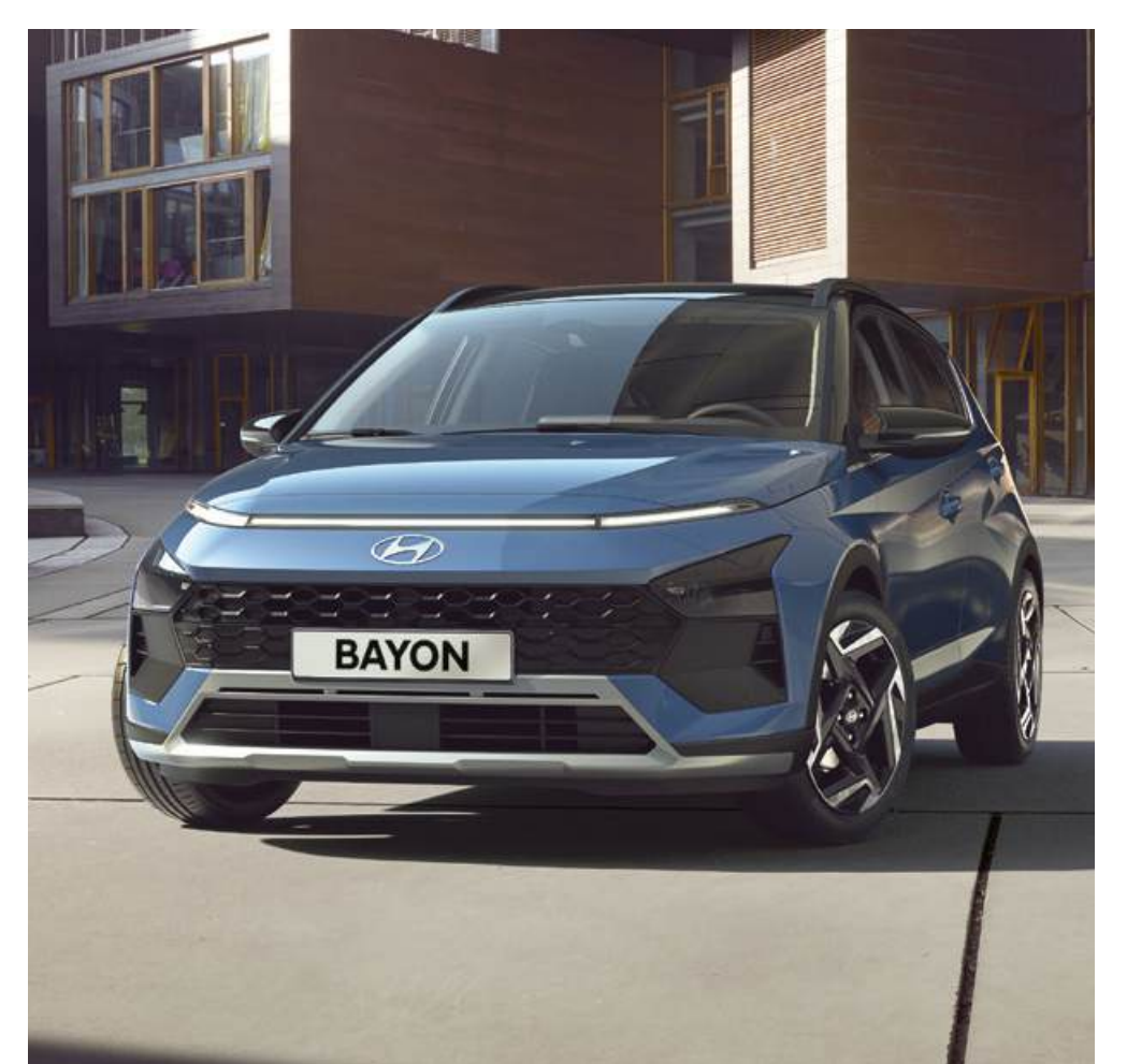
The new Seamless Horizon LED Daytime Running Lights harmonise with the enhanced front bumper and radiator grille for a more rugged look.