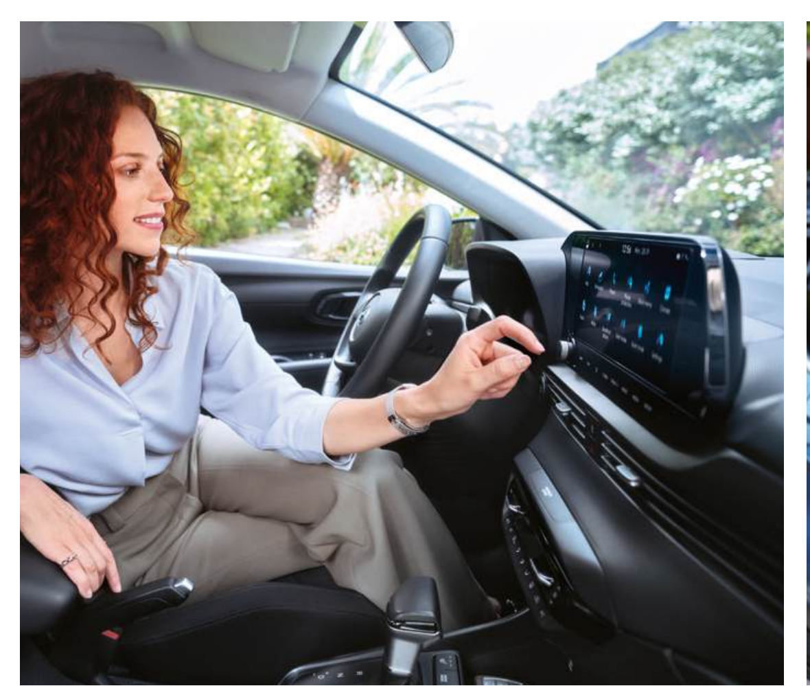
Apple CarPlay™ and Android Auto™ are on board as well, so you can mirror your apps, music, and phone layout onto the big screen.*

Enjoy state-of-the-art connectivity with dual big screens and split-screen functionality. BAYON's advanced digital cockpit and top-line infotainment features have been made even better, thanks to the introduction of Over the Air (OTA) map and infotainment updates.