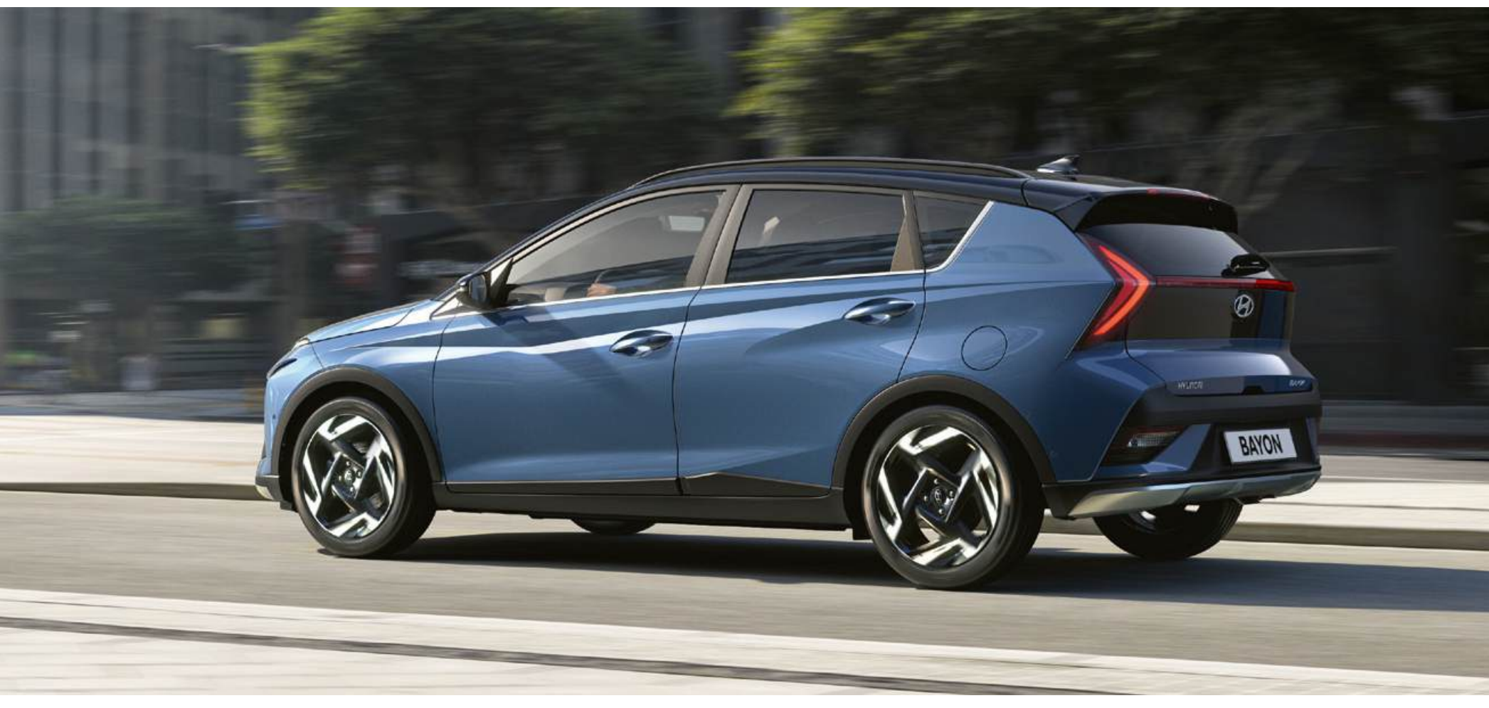
On the side, the dynamic shoulder draws the eye into the strong graphic features, the powerful c-pillar form, and the sporty wedge-shaped profile.

With its sharp lines and eye-catching proportions, BAYON really stands out from the crowd. Upgraded with robust new design elements, BAYON makes a fresh, dynamic statement with its distinctive crossover look.