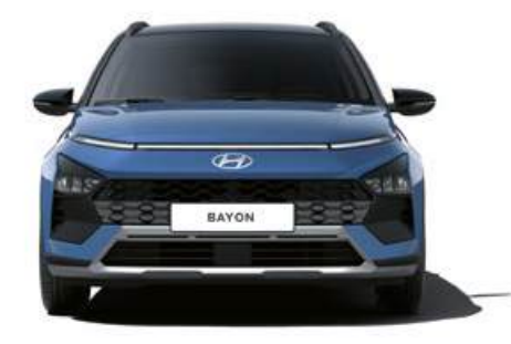
Overall Width 1,775 Wheel Tread (15"/ 16"/ 17") 1,551 / 1,775 / 1,546